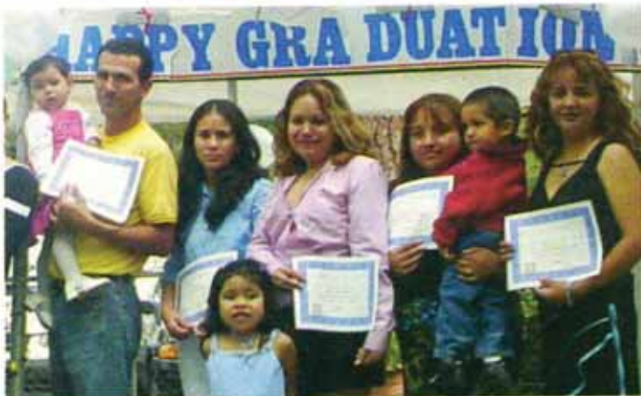
Proud moms, dads and kids at "graduation"

newsletter compiled in the ESL classes, "but it wasn't easy. ... He is a brave boy who was raised at Mothers' Club. ... We remember this every time we look at his sticker that says: 'Student of the Month.'" AM