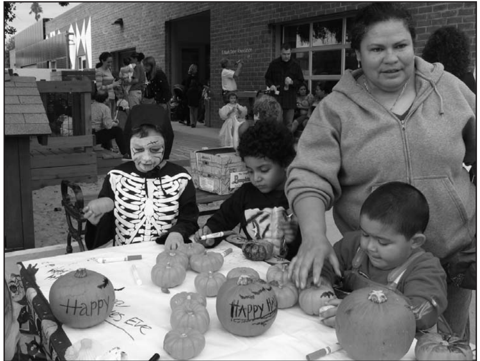
Children decorate pumpkins at Mothers' Club's first family event in its new home.