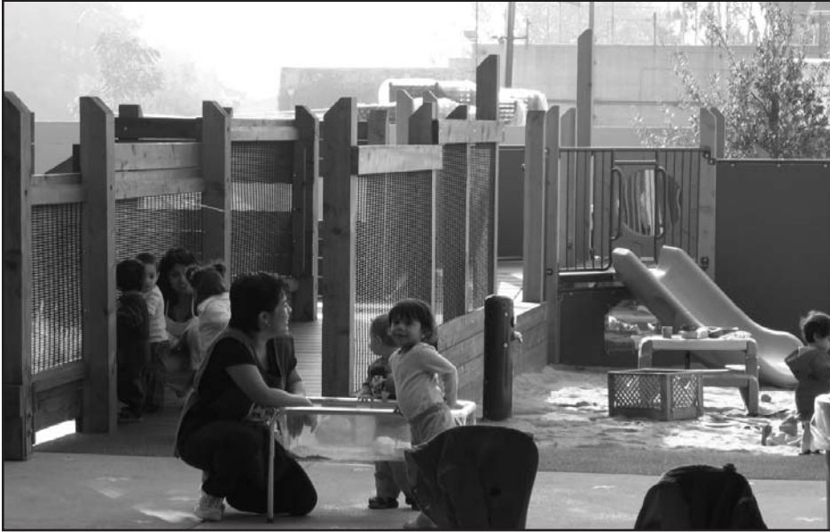
Toddlers enjoy their new play yard in the S. Mark Taper Foundation Outdoor Learning Center

It was October 30, the day before Halloween, but the Mothers' Club Grand Opening was our Thanksgiving, Christmas, New Year's and every other holiday wrapped into one glorious celebration! Many of us were still in a state of disbelief. It seemed like yesterday that we had walked through the cavernous shell of our building trying to imagine its future shape, and now we were celebrating its transformation into a vibrant, welcoming learning center.