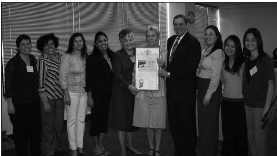
Mothers' Club staff with representatives from LACOE and First 5 LA

If all new school construction and See Green Schools, page 3