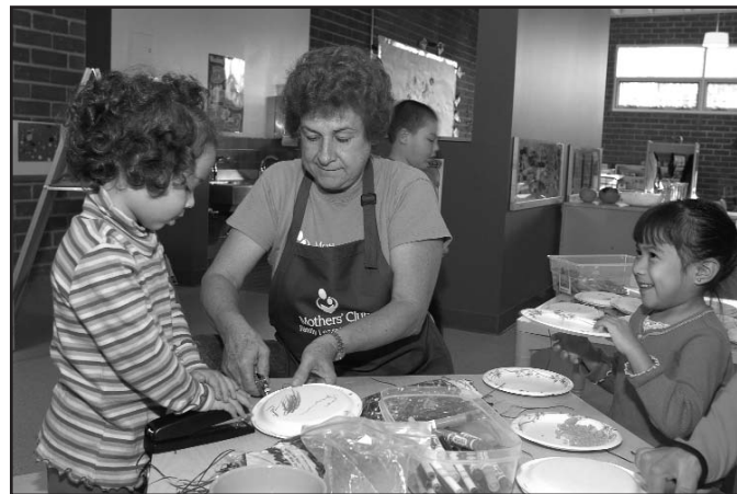
Preschoolers create art projects from recycled materials.

Validation , continued from page 2 recognized Mothers' Club as an Exemplary Family Literacy Program. The ceremony took place at First 5 LA's headquarters in Los Angeles.