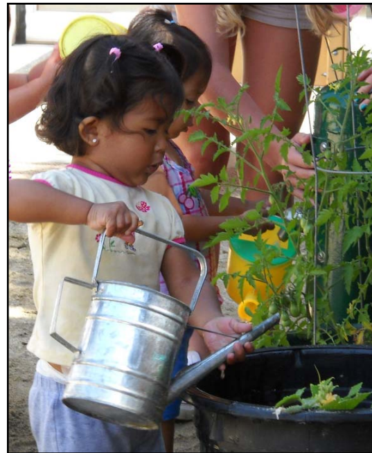
Like the children at our center working to help their gardens grow, Board members work hard to help Mothers' Club grow.