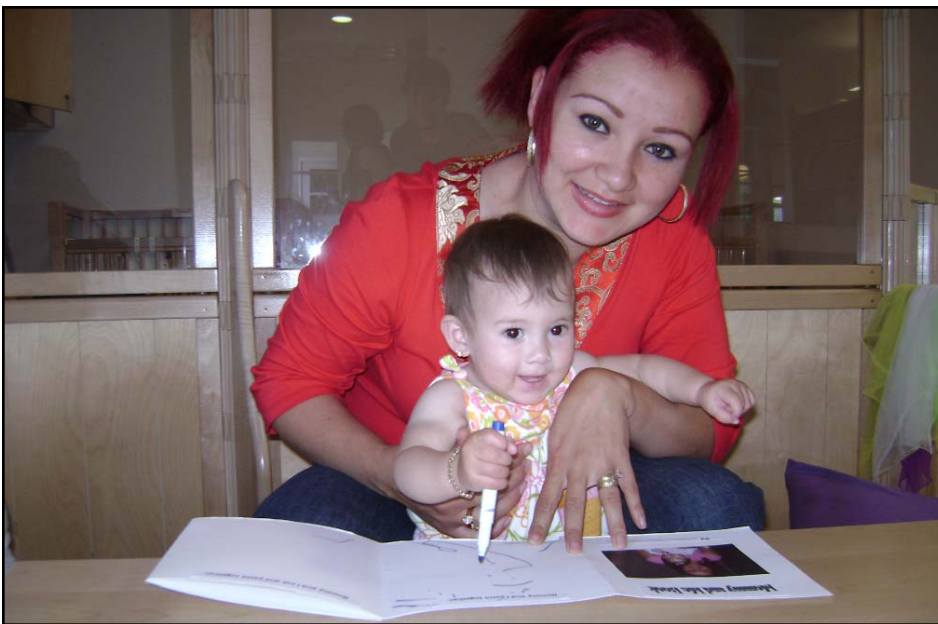
A young mother with her baby at Mothers' Club.