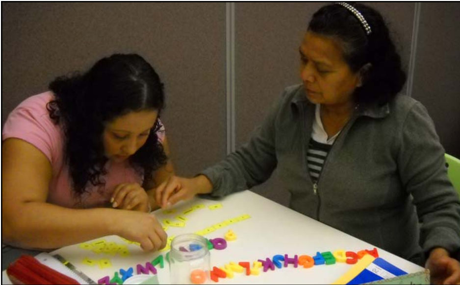
Despite the fact that these two mothers did not finish elementary school themselves, they work together, practicing their letter recognition and phonics, so that they will be able to support their children's education.